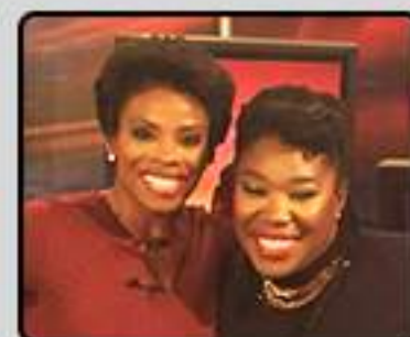
FOX 32 CHICAGO PERFORMANCE