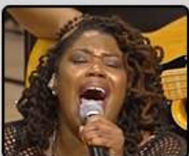
CHICAGO BULLS HALFTIME SHOW